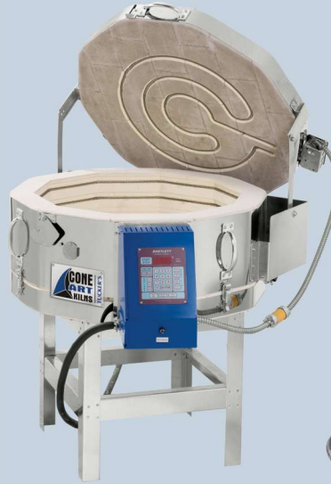
V62309G (Shown with optional lid-lifter)