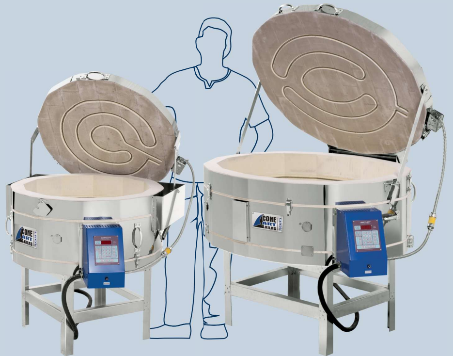
V62813G (Shown with optional lid-lifter)