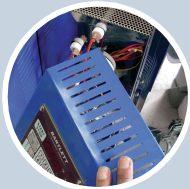
Easy Access Panel