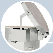
PATENTED "LID-LIFTER" Lids that lift with ease.

At Cone Art we know you pour your heart and soul into your craft. Our kilns are packed with features that have made our kilns renowned for their reliable, worry-free firing, easily to cone 10, with brilliant firing results. Smart design - our kilns were thoughtfully designed for ease of use. From our patented "lid-lifter" system to our sectional design - we build kilns that are easy to use, easy to maintain and easy to move. Owning a kiln shouldn't be a chore. Cone Art Kilns boast even heat from top to bottom and the best energy savings in the business. No other kiln matches the features and benefits of a Tucker's Cone Art Kiln.