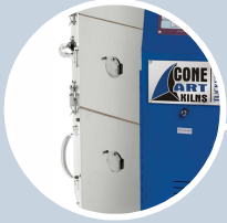
SECTIONAL DESIGN Makes delivery & set up a breeze.