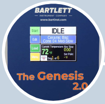
CONTROLLER OPTIONS WiFi enabled software up-datable controllers.