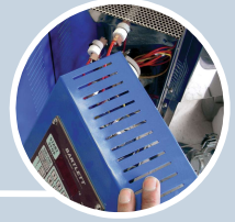
EASY ACCESS PANEL Well vented, easy access panel for effortless maintenance.