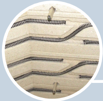
MULTI-ZONE CONTROL Multiple thermocouples means even firings from top to bottom.