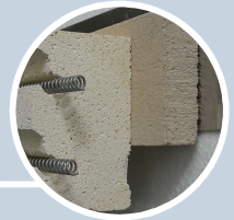
DOUBLE WALL DESIGN Extra insulated walls for energy savings.