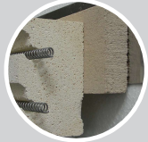
Double Wall Construction