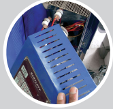
Easy Access Panel