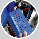
Easy Access Panel