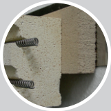
Double Wall Construction